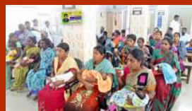
Public Awareness Campaign

Rotary Club of Tirunelveli Central attended and distributed leaflets about the advantages of breastfeeding to the public attending the hospital.