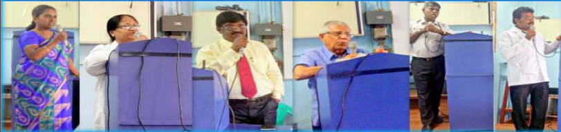
Dignitaries addressing the audience

WORLD BREAST FEEDING WEEK - 2016 BREAST FEEDING : A KEY TO SUSTAINABLE DEVELOPMENT.